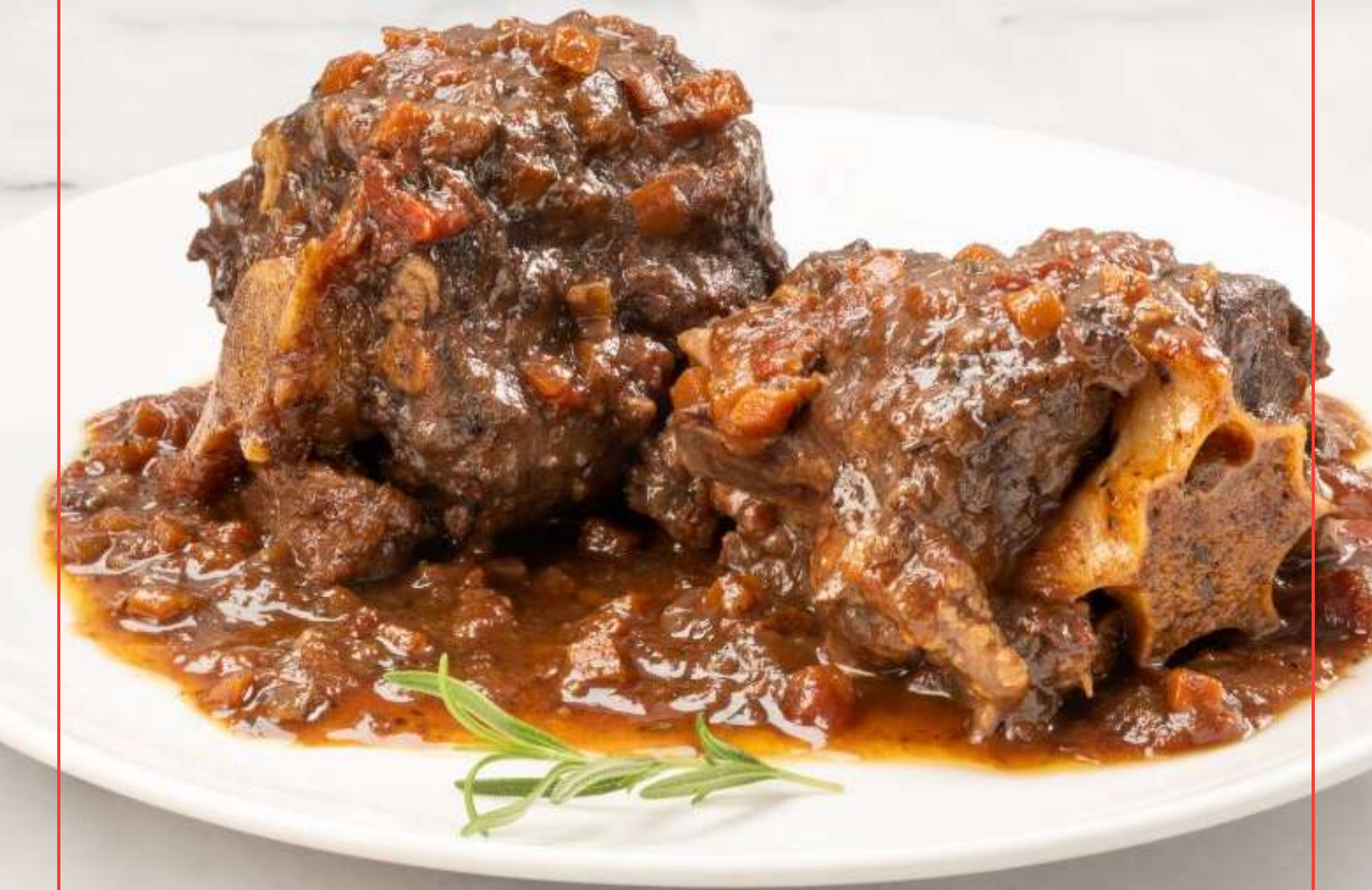
Braised Beef Oxtail In Red Wine Tomato Sauce